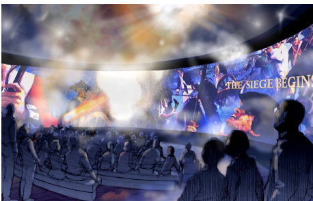
Exhibit design concepts for immersive environment and experiential theater.

“The British Empire and America” examines the geography, demography, culture and economy of America prior to the Revolution and the political relationship with Britain. “The Changing Relationship – Britain and North America” chronicles the growing rift between the American colonies and Britain. “Revolution” traces the war from the Battles of Lexington and Concord in 1775 to the Declaration of Independence in 1776 to victory at Yorktown in 1781 and the aftermath. “The New Nation” outlines the challenges faced by the United States in the 1780s and the creation of the Constitution as a framework for the future. “The American People” explores the emergence of an American identity following adoption of the Constitution.