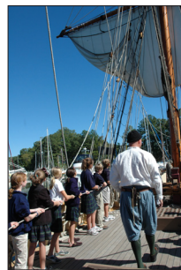
Lancaster County students set a sail on the Godspeed .

Jamestown Settlement’s Godspeed sailed to four Virginia ports in 2010, hosting a total of 6,600 visitors at Norfolk Harborfest, Hampton Bay Days and the Urbanna Oyster Festival and in Lancaster County. More than 500 students took part in Jamestown-Yorktown Foundation maritime education programs in conjunction with the Lancaster and Urbanna visits in the fall. The ship’s voyages were supported with private donations to the Jamestown-Yorktown Foundation, Inc.