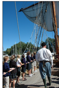
Lancaster County students set a sail on the Godspeed .

Jamestown Settlement’s Godspeed sailed to four Virginia ports in 2010, hosting a total of 6,600 visitors at Norfolk Harborfest, Hampton Bay Days and the Urbanna Oyster Festival and in Lancaster County. More than 500 students took part in Jamestown-Yorktown Foundation maritime education programs in conjunction with the Lancaster and Urbanna visits in the fall. The ship’s voyages were supported with private donations to the Jamestown-Yorktown Foundation, Inc.